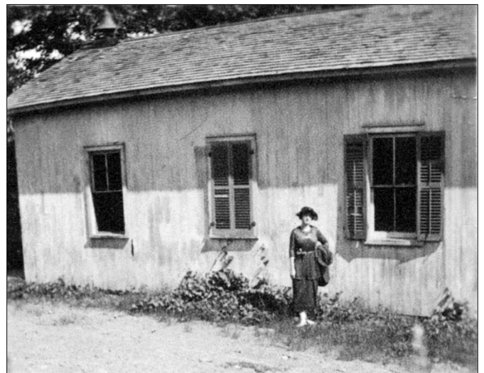
No. 18 School

Jerusalem District No. 18 – Wagener House , or Kern , as it was most often referred to, was built in 1876 on the Southernmost tip of the Bluff. It remained in operation until the mid 1930's when it was closed and students were bussed up to No. 14 School in Branchport.