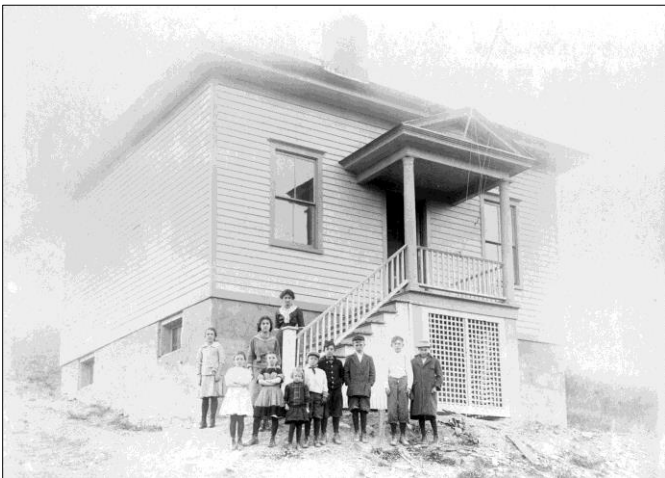
No. 20 - Built 1914