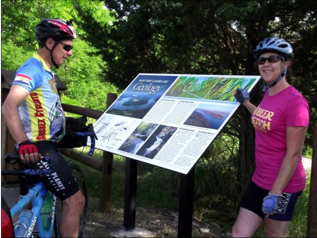
Onlookers enjoying new overlook signs