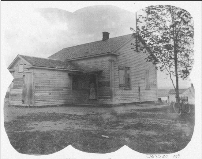
Original No. 20 1885-1913

Jerusalem District No. 20 – Huff , located at the top of Brown Hill on Vine Rd, was established in 1885. The original school building was destroyed by fire in 1913. The new school was completed in 1914. No. 20 now stands in its original location as a lovely private residence.