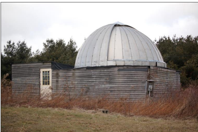
No. 5 School in its current condition

Jerusalem District No. 19 – Cinconia , located on West Bluff Drive, was established in 1880 and remained in operation through 1934. School 19 students were then bussed to No. 14 School in Branchport. The building has since been moved from its original lakefront location, across the road and up the hill and repurposed into a two story residence.