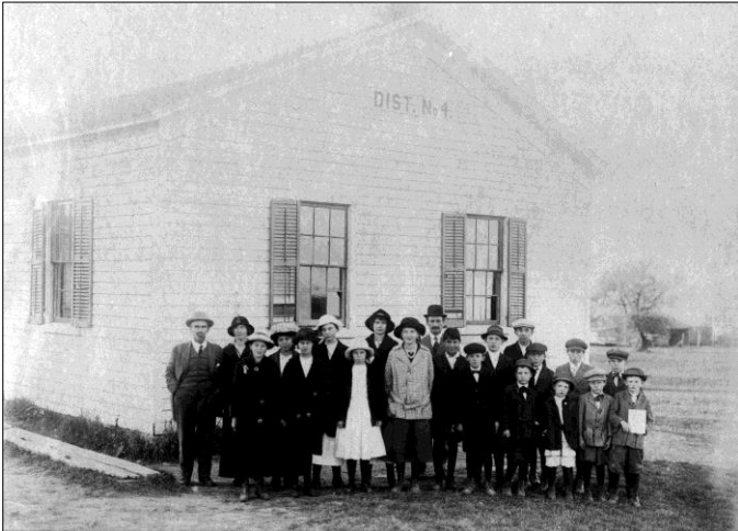
No. 4 School – Fingar

Jerusalem District No. 5 – Kenyon , was located at the intersection of Scott Rd and Skyline Drive. It has been repurposed into an observatory.