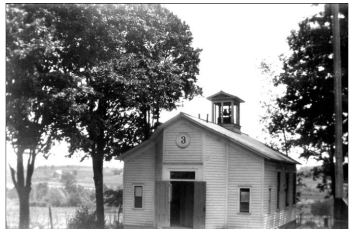
No. 3 School – Kinney's Corners

Jerusalem District No. 3 – Kinney's Corner , established in 1829, stood opposite the Bluff Point Methodist Church. A new school building was dedicated in 1876. When 54A was widened in 1930 the schoolhouse was moved to Coates Rd just behind the church. Featured on the 2012 House Tour, it is now a stunningly restored private residence, original belfry and all.