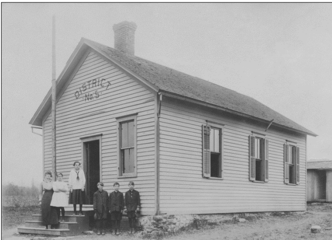
No. 5 School

Jerusalem District No. 5 – Kenyon , was located at the intersection of Scott Rd and Skyline Drive. It has been repurposed into an observatory.