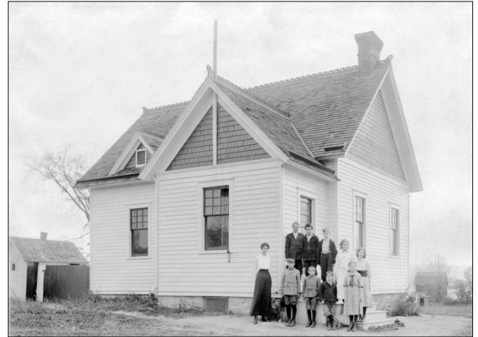
No. 2/21 School – Keuka Park

Jerusalem District No 2 – Keuka Park , or "21" as it is referred to on the Deed was deeded by Keuka College to the Jerusalem School District in 1903. Legend has placed it where the Southernmost gravel parking lot now exists on Central Ave directly across from the Weed Physical Arts Building and field. Per the deed, the property reverted back to the College when the education system was consolidated in the mid 1950's. The school building stood on this site until it was dismantled in 1969.