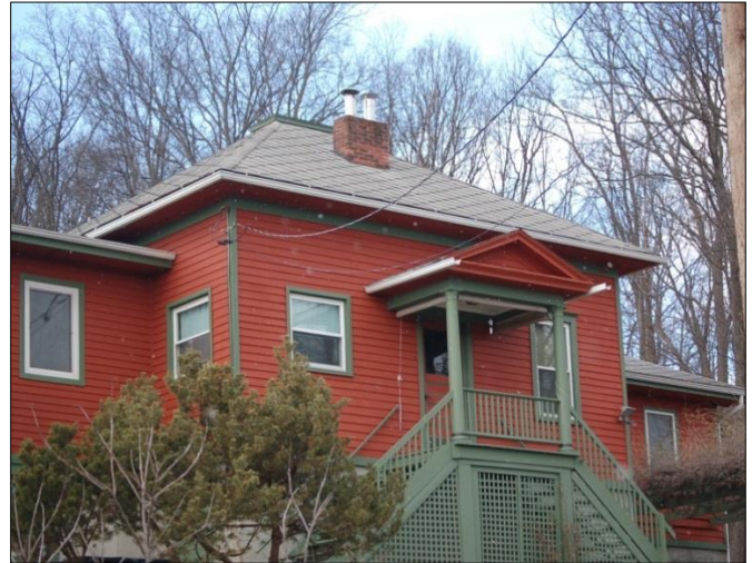
No. 20 As it stands now