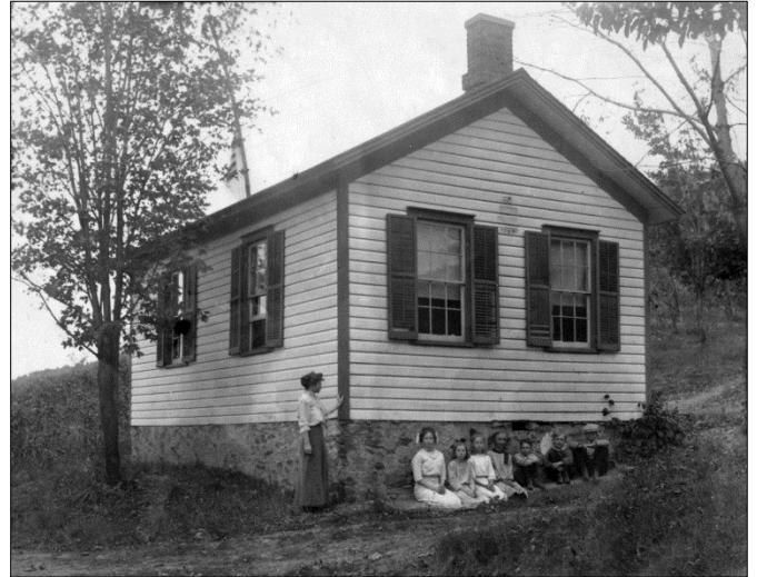
No. 19 School - Cinconia

Jerusalem District No. 19 – Cinconia , located on West Bluff Drive, was established in 1880 and remained in operation through 1934. School 19 students were then bussed to No. 14 School in Branchport. The building has since been moved from its original lakefront location, across the road and up the hill and repurposed into a two story residence.